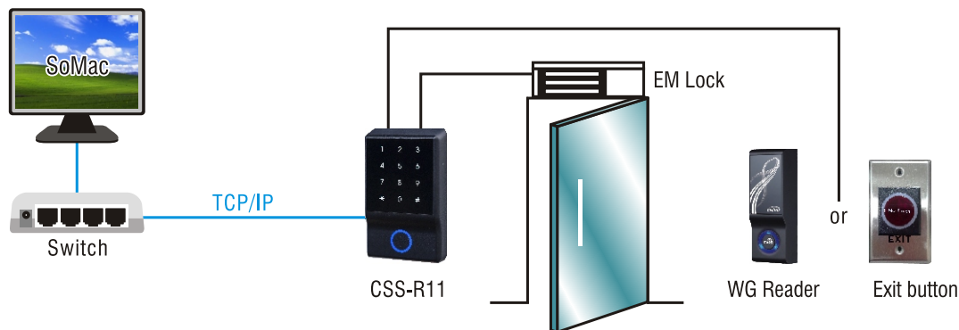
(Standalone + Non POE version RELAY BOX)